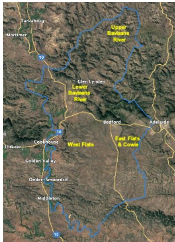
Figure 1: Bedford magisterial district and Bedford Fire Protection Association (FPA) boundary (blue line), and divisions of the FPA